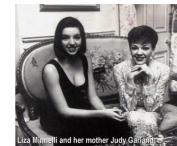
Liza Minnelli and her mother Judy Garland